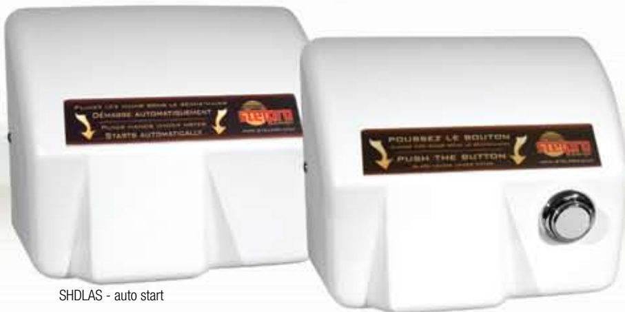
SHDLAS - auto start