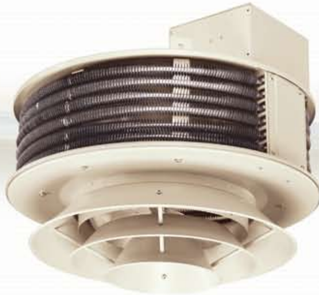
triple cone unit (optional cone)

With the air intake at its sides, the VUH draws in the warm air at the ceiling and re-directs it where it is needed most. Ideally suited for areas such as factories and warehouses with high ceilings, the VUH is perfect for those high heat loss shopping mall entrance ways. A fan switch transforms this heater into a fan which recycles warm air.