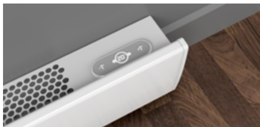
ULTRA PRECISE ELECTRONIC THERMOSTAT (OPTIONAL)